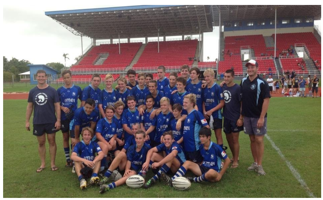
MJRC U 15 TOUR - Pre game photo at Apia Stadium - 23 April 2013

The tour involved a mixture of both 15 and 7 a side rugby matches and although we didn't retain the Aggie Grey trophy in the final game all the boys had a great experience playing at the national stadium in Apia.