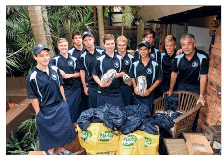
Members of the Mosman Rugby Club who are travelling to Samoa.

perience for the boys. The Whales will play matches and seven-a-side games against schools in Fao Fao and Apia.