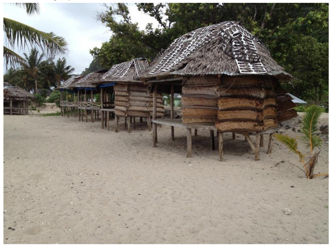
Beach Fale's at Fao Fao