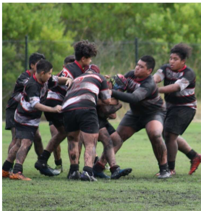
Ed Barton vs West Harbour. Weight for Age discussion anyone?