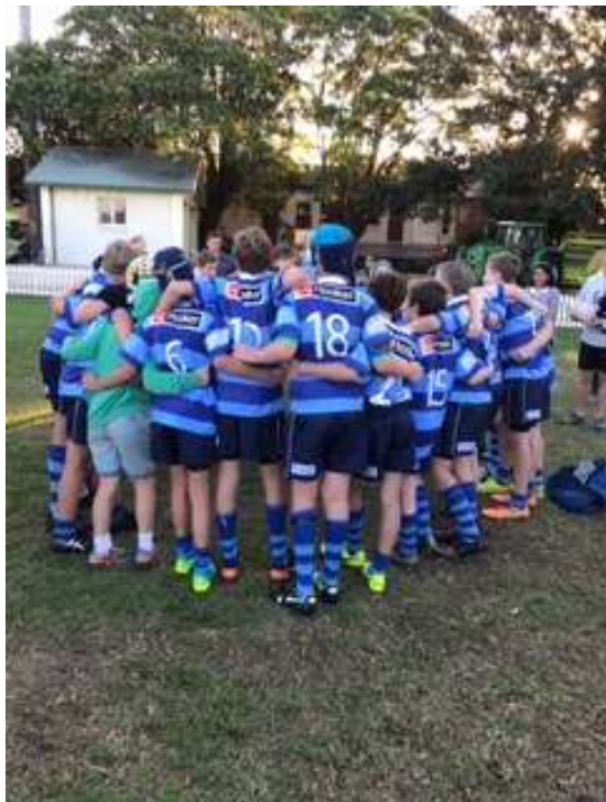
Singing the MJRC Club Song