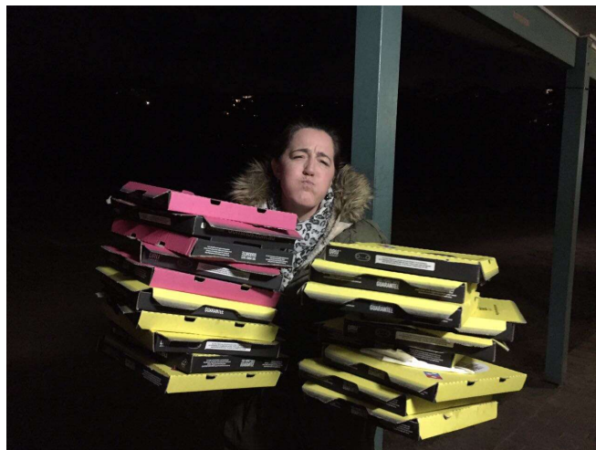
Stocking up on pizzas for hungry boys