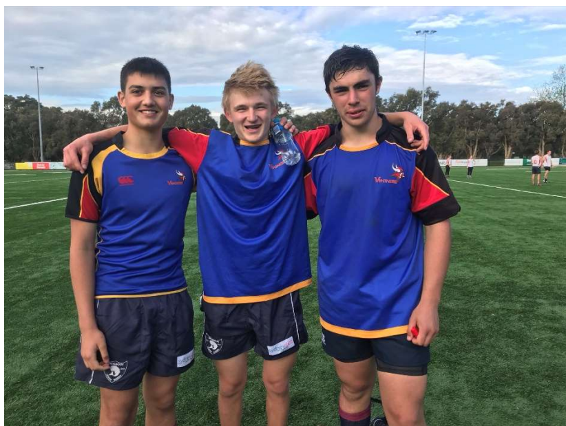
RU16 Vikings JV v Penrith @ Rawson